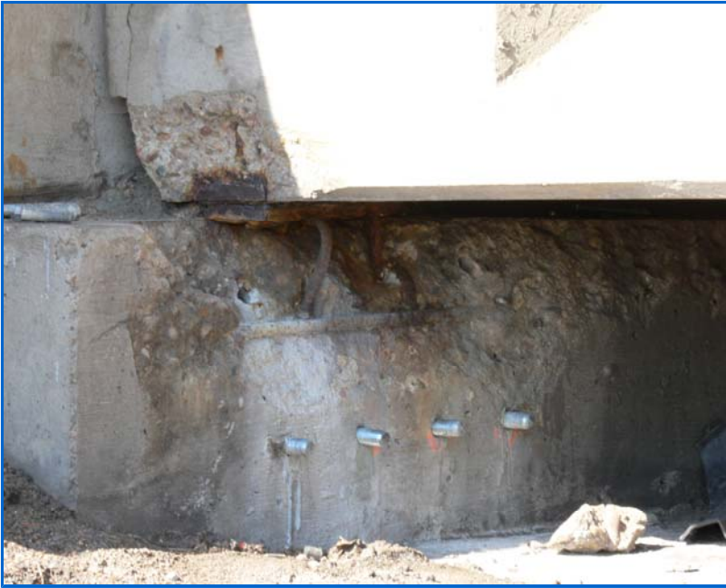
I17DG (Spalling below Girder 1Q at Abutment 1).JPG