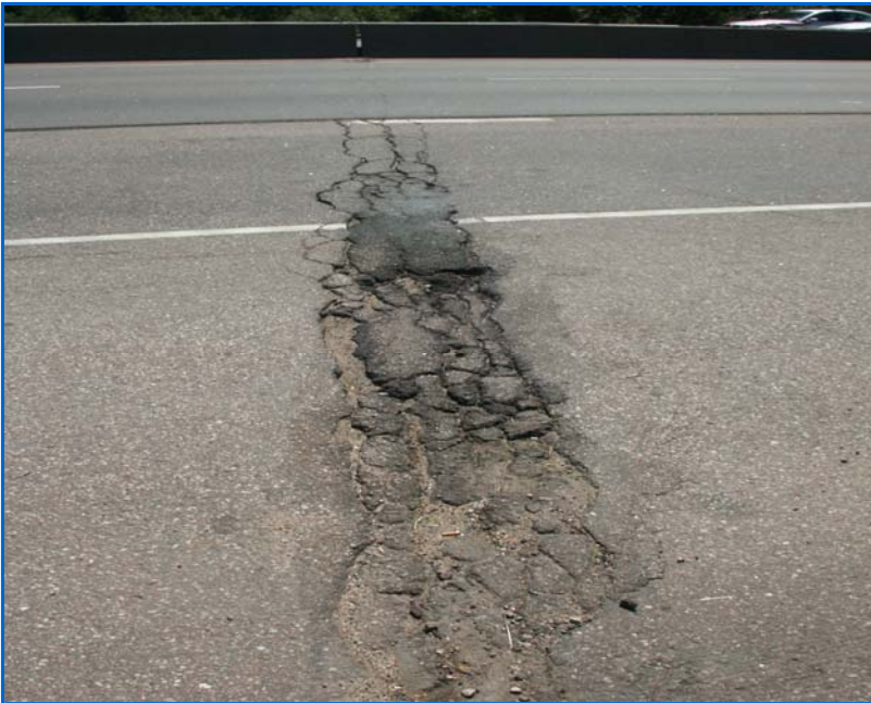
I17DG Asph. above Abut 5 outside lane and shldr is cracked moderately and has potholes.JPG

\\public\bridge common\briar please use this\gold\damage\